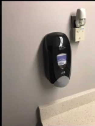
Hand sanitizer refill (Complete)