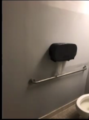
Main Building Men's Restroom Wall Hole Patch (Complete)