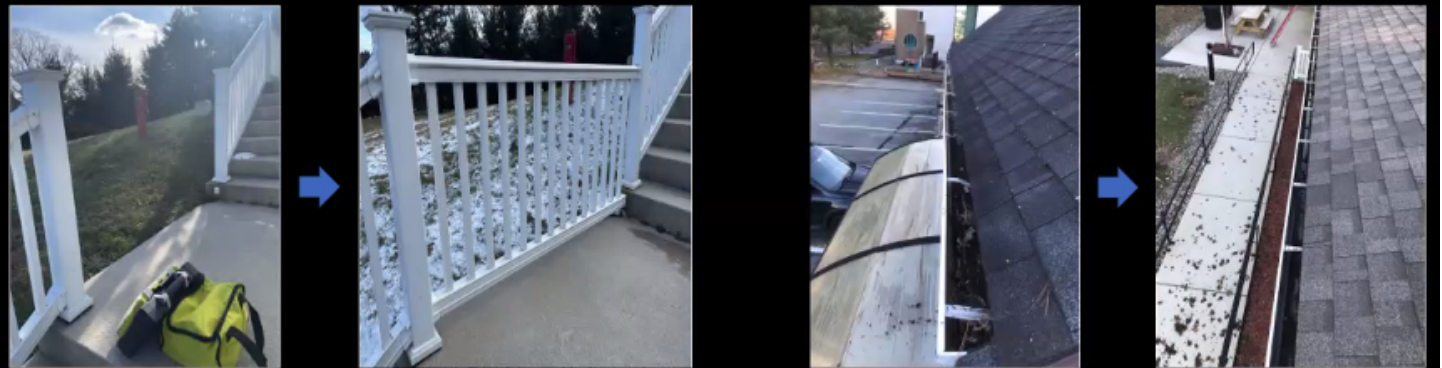
151 Handrail Repair (Complete)